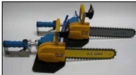
Air • Gas • Hydraulic Chain Saws