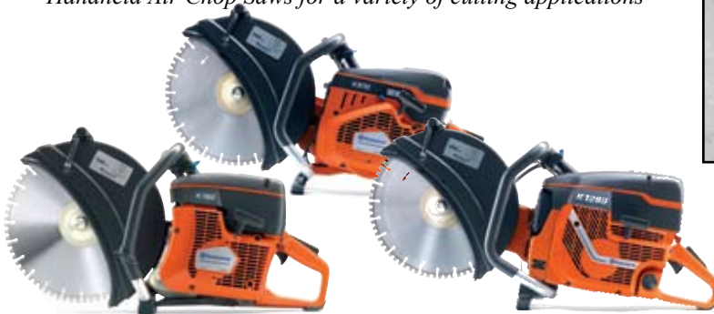
Gas Chop Saws for a variety of cutting applications