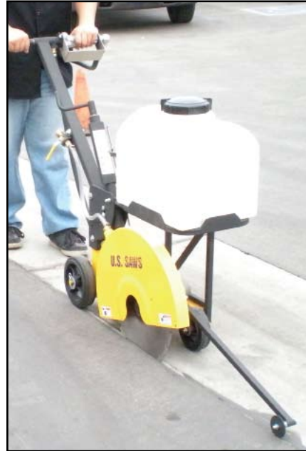
Walkbehind Air Saws and Accessories