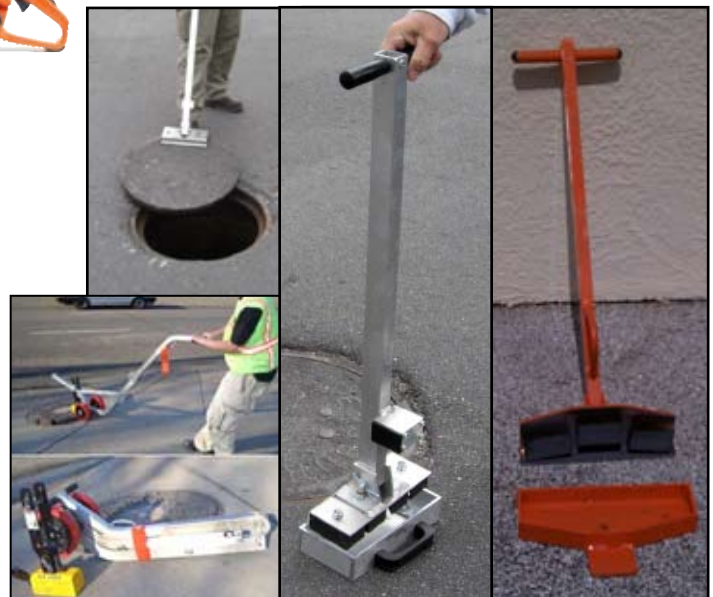
Magnetic Manhole Lift Systems and Accessories