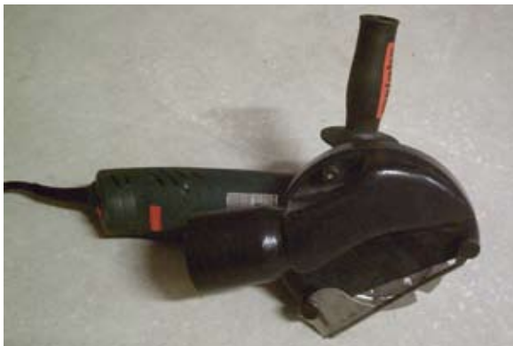
Tuckpointer shown with blade (sold separately)