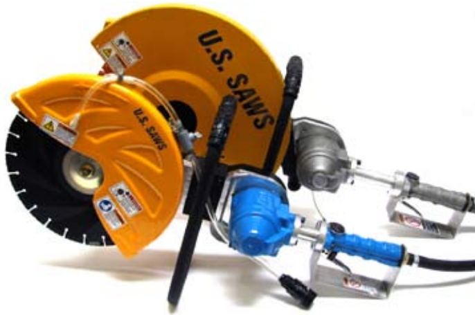
Handheld Air Chop Saws for a variety of cutting applications