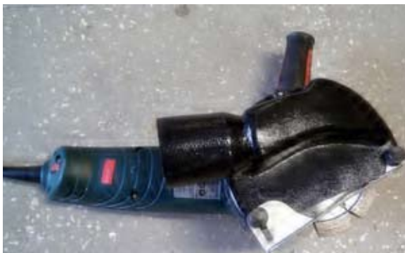
Tuckpointer shown with blade (sold separately)