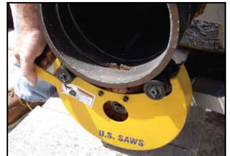
Belly Saw for cutting the underside of pipes in confined spaces