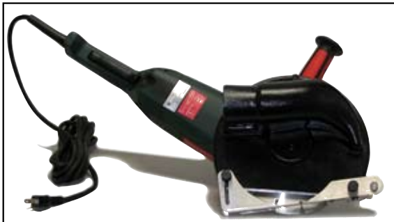
Cut-Vac shown with blade (sold separately)