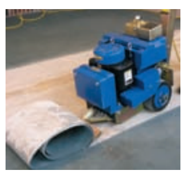
Self-propelled with instant forward & reverse