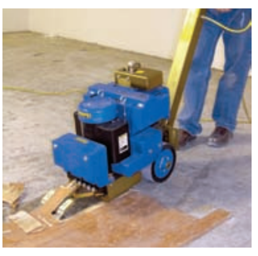
Removes the worst of today's glued down floors