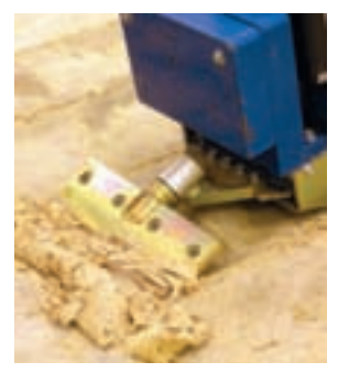
Razor blade cutting head for rescrape