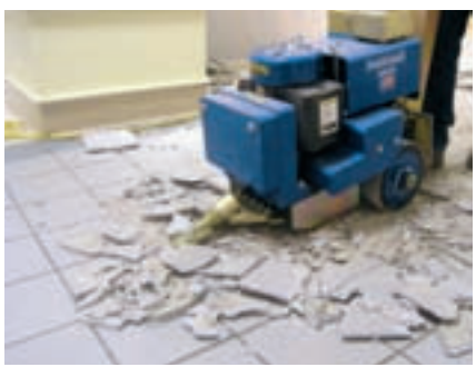
Handles most tough jobs