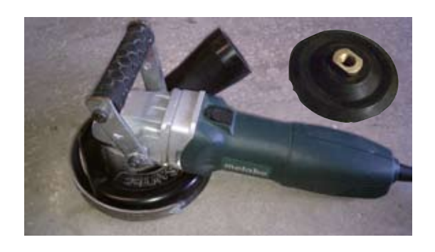
Dependable units great for polishing countertops, working in tight areas or in smaller areas