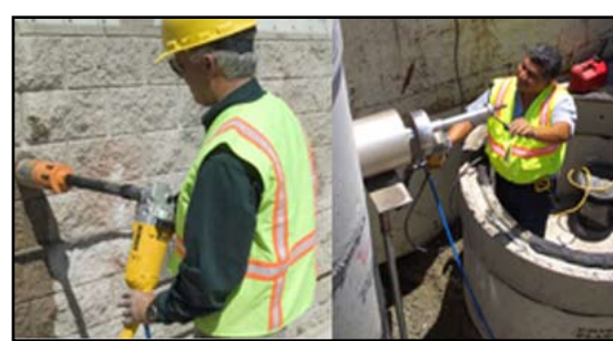
CoreEZ<sup>™</sup> Portable Core Drilling Systems