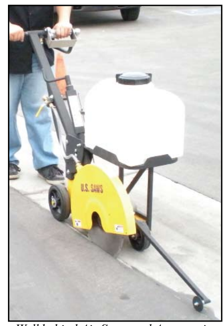
Walkbehind Air Saws and Accessories