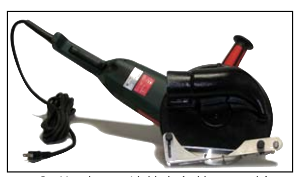
Cut-Vac shown with blade (sold separately)