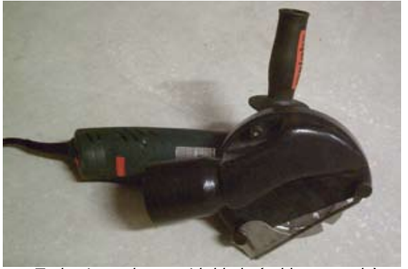
Tuckpointer shown with blade (sold separately)