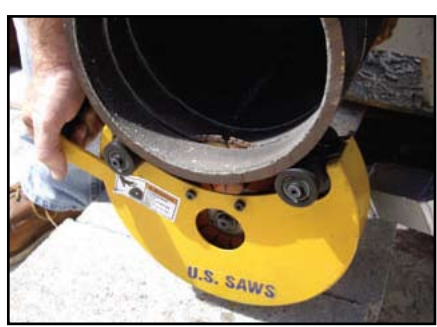
Belly Saw for cutting the underside of pipes in confined spaces