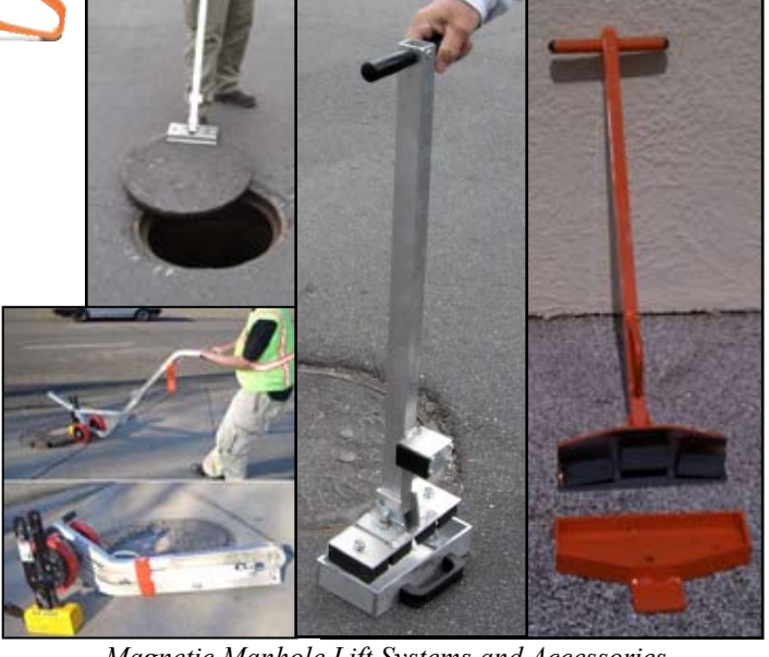
Magnetic Manhole Lift Systems and Accessories