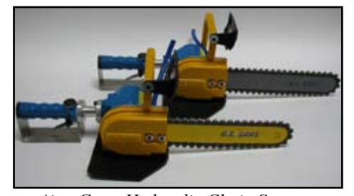
Air • Gas • Hydraulic Chain Saws