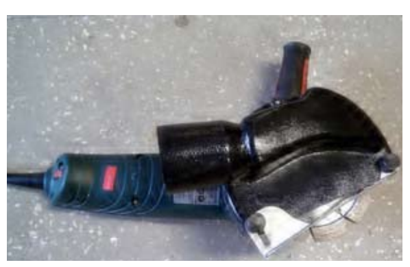
Tuckpointer shown with blade (sold separately)