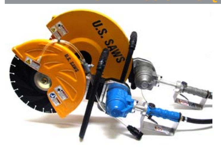
Handheld Air Chop Saws for a variety of cutting applications