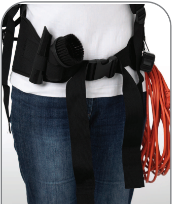
Accessories are stored on belt for easy reach