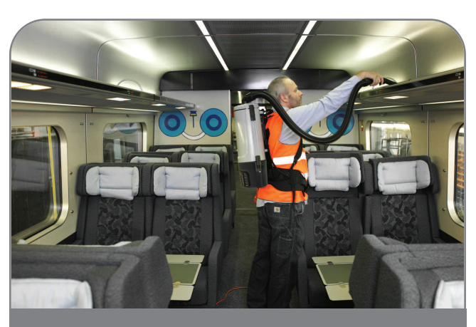
Hard-to-reach areas in the transportation industry