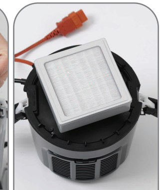
upstream HEPA filte

The GD10 Back Vacuum was designed with comfort and ease-of-use in mind. For its small size, the GD10 Back is incredibly powerful and equipped with a variety of features for fast, effective cleaning in a multitude of industries.