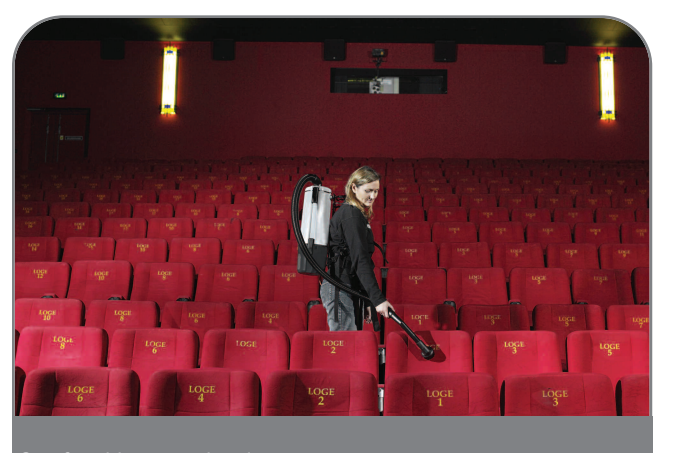
Comfortable general maintenance