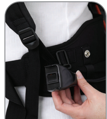
On/Off switch is conveniently located on the belt for easy reach