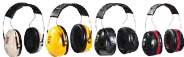
3M Peltor Optime Earmuffs: A market standard

3M Peltor Optime Earmuffs offer versatile protection that meets the needs of a majority of workplace applications.