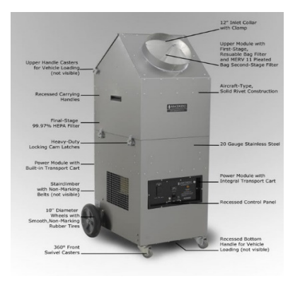
Duct Cleaning Equipment: Vacuum i.e. Hepa Aire 2500, compressor, and whips